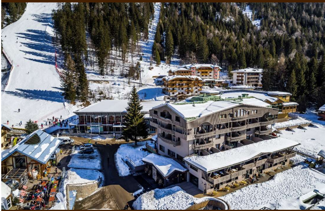
Madonna di Campiglio – Brenta Dolomites