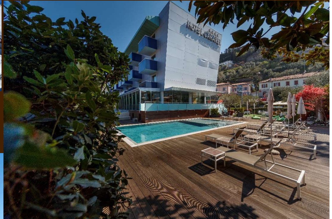
Torbole – Garda Lake